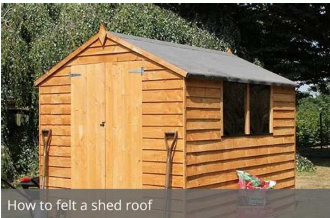
How to felt a shed roof